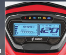
FULLY DIGITAL SPEEDOMETER WITH BLUETOOTH CONNECTIVITY