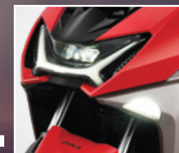
FIRST IN SEGMENT CORNER BENDING HEADLIGHTS