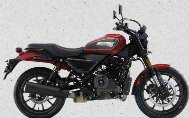
Metallic Thick Red