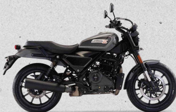
Metallic Dark Silver