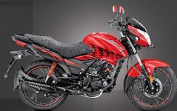
Candy Blazing Red