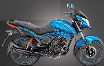
Techno Blue Metallic