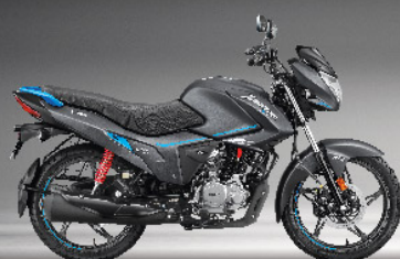
MATTE AXIS GREY