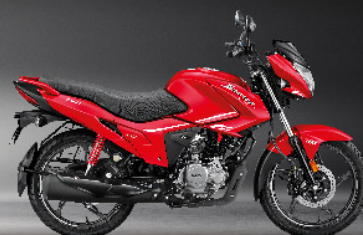
Candy Blazing Red

Regd. Office: Hero MotoCorp Limited, The Grand Plaza, Plot No.2, Nelson Mandela Road, Vasant Kunj - Phase -II, New Delhi - 110070, India. CIN: L35911DL1984PLC017354. Phone No.: 011 - 46044100. For further information, contact nearest Hero MotoCorp authorised outlet or call our toll free no.: 1800 - 266 - 0018 or visit us on www.heromotocorp.com . Accessories and features shown may not be part of standard fitment. Always wear a helmet while riding a two wheeler.